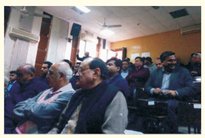
The recent OCA General Meeting & Elections in Dec 2014 witnessed the highest ever turnout of 300 Old Columbans