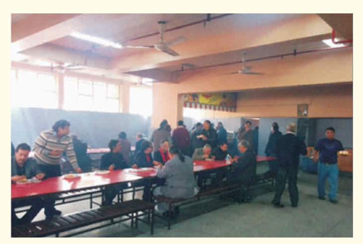
Old Columbans reliving their days of Patties in the Middle School Canteen