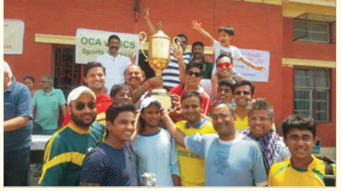
Football Team celebrates!