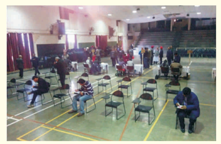
OCA Executive Committee Election process underway in Dec. 2014 at Br. Edmund Rice Hall

On 20th December 2014, the Annual General Body Meeting was held in the school which witnessed a historic participation of over 300 Old Columbans! While the attraction of the ever-famous Middle School Canteen patties and chhole bhature is always a crowd puller, it was a heartening sight to see the corridors of our alma mater flooded with members from across over 60 years!