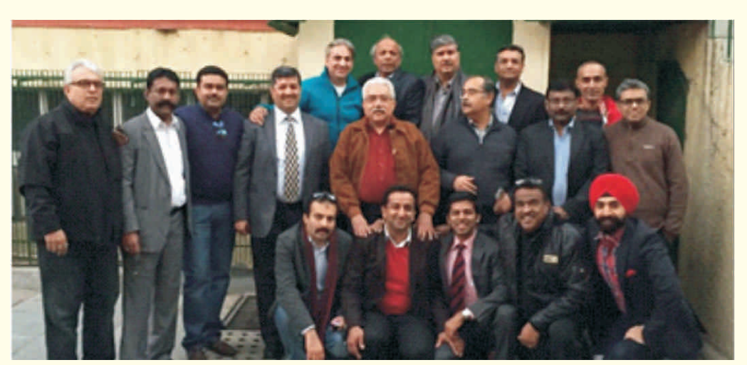
Old Columbans gather outside the OCA Centre in the Middle School Building